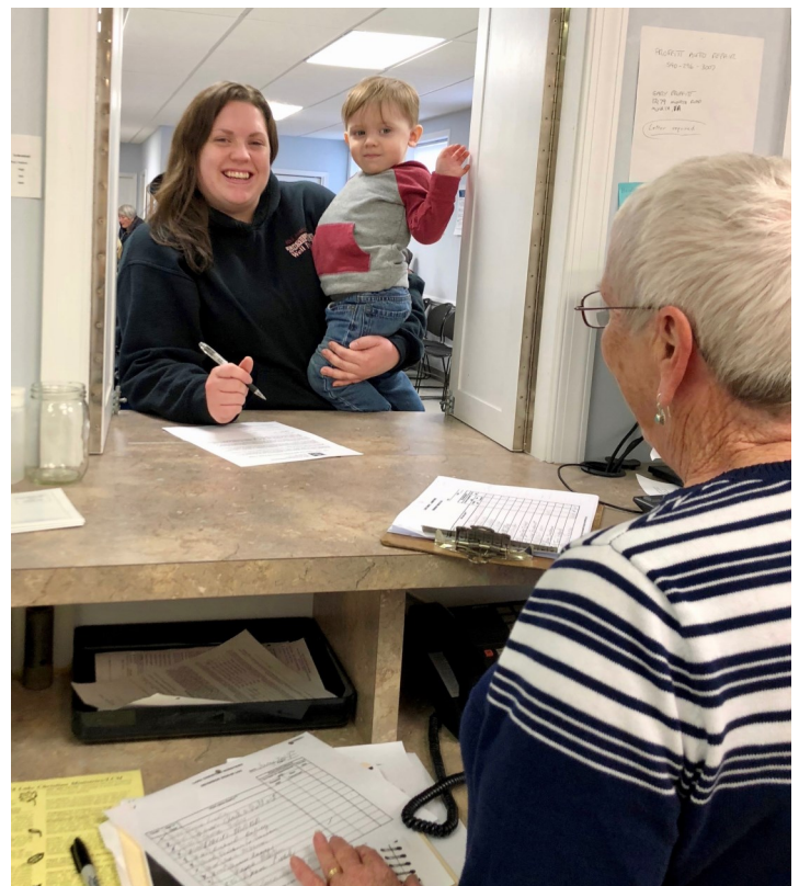
New Tomorrows Neighbor checks in at LCM.

And, eight Neighbors were able to use grant funding from the Bedford Community Health Foundation to address medical needs.