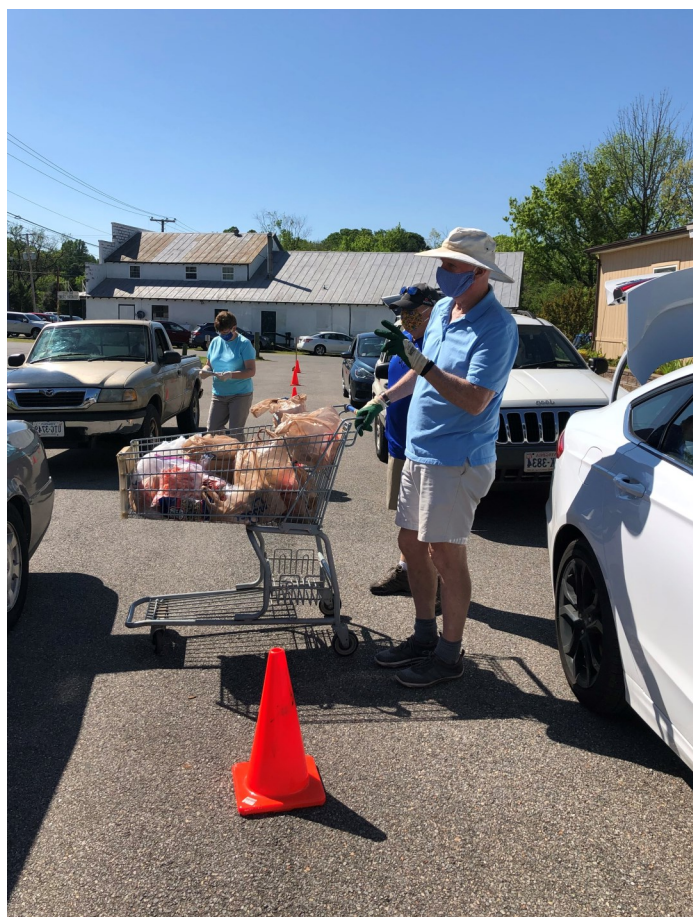
Volunteers provide curb-side food assistance.